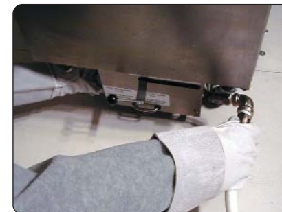
9. After rinsing debris, close drain valve and disconnect hose. Push black knob on valve to the right (Oil to Fryer). Turn on pump and refill fryer.