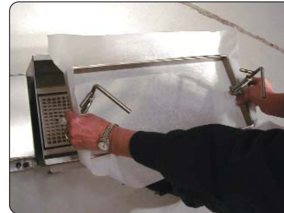
1C. Place the filter paper and hold down ring into the tub together.