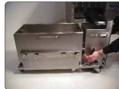
3. Lock the filter tub in place by pulling the tub forward as shown.