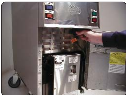
4B. Insert plug into receptacle.