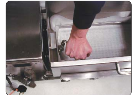
1D. Ensure there are no folds in the paper and press down and turn the hold down ring handles, locking each in place. Sprinkle 1 pkg. Acidox on top of paper.