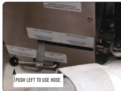
8. If debris is excessive, connect the hose to the filter tub as shown in Step 9. Open the valve for the hose by pushing the black knob to the left. Turn pump on and rinse side of tank with hose.