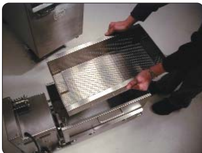
1E. Place the crumb basket on top of the filter tub.