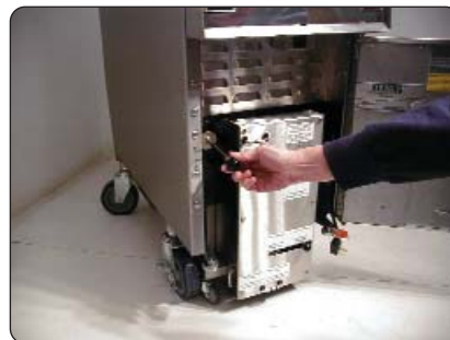
6. Turn fryer off. Slowly drain oil by pulling the drain handle forward (oil must be between 250°-300°.)