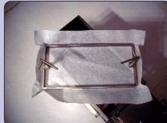
Hold Down Ring and Paper