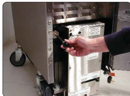
7B. Close drain valve. Lock the handle in place to activate the safety switch. Refill fryer. Turn pump off 15 seconds after air bubbles appear in the oil.