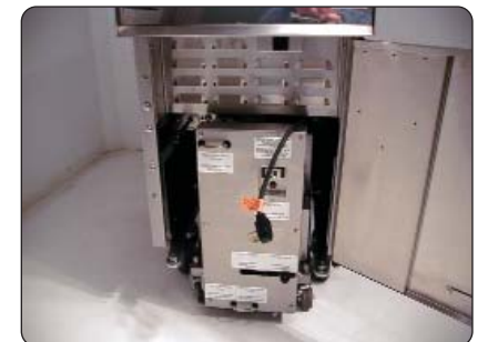
4A. Roll filter machine under fryer and lock into place. Pull on the filter lightly to ensure a good connection.