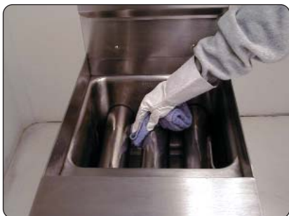
7A. Turn pump on and rinse tank into filter. Turn pump off. Wipe fry tank with a cloth.

With drain handle still open, oil may be pumped into the fryer through the return lines (step 7a and 7b), or the hose (step 8-9) if debris in fryer is excessive.