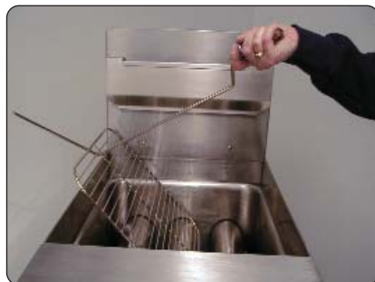
5. Remove screen over tubes. Stir oil thoroughly to evaporate moisture in the fry tank.