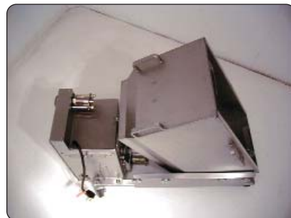
2. Install the tub onto the filter cart as shown (rear lip under the cart first, then lay down the front).