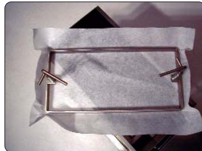
1B. Center the hold down ring onto the filter paper.