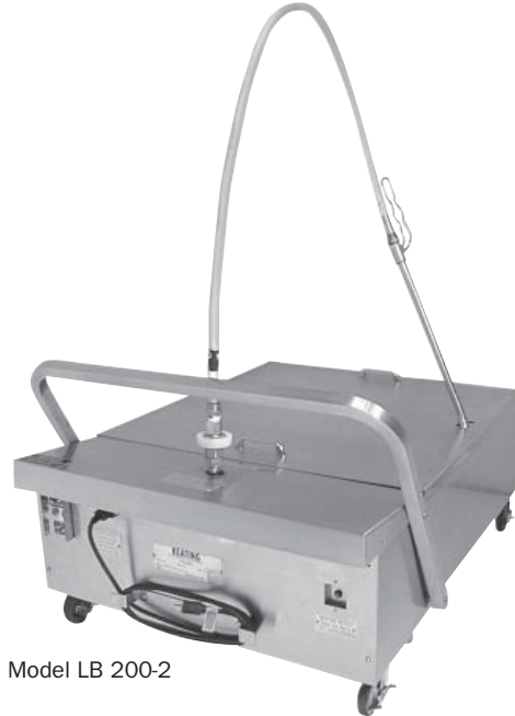
Model LB 200-2

The Keating Portable Filter is designed to minimize oil breakdown and extend oil life. Built for use with appropriately sized front drain fryer models, the Portable Filter is easily maneuvered and can be rolled away for storage.