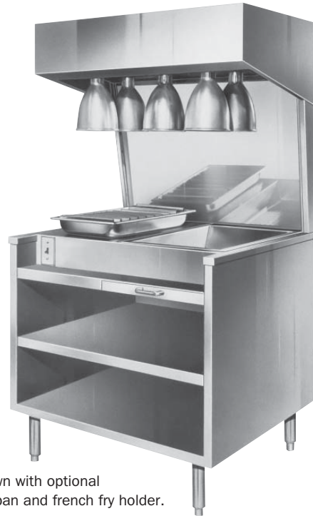
Unit shown with optional 12 x 20 pan and french fry holder.

Keating's Salting / Bagging Station features a convenient preparation area as well as a heated holding and display station. The durable design and Stainless Steel construction allows you to easily serve a wide variety of foods such as french fries, chicken, fish and many more items. The Salting / Bagging Station features Keating Keep Krisps® to keep foods hot and fresh prior to serving. Also available with a flat top, the Salting / Bagging Station gives you more flexibility during your prep time.