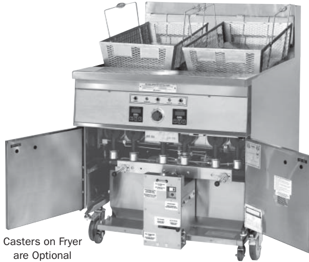
Casters on Fryer are Optional

The Safe & Easy® Filter is completely contained within the cabinet of a standard Safe & Easy® Keating Instant Recovery® Fryer. The Safe & Easy® Filter requires no additional kitchen space beside or behind the fryer.